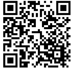
Scan the QR code to view the property online