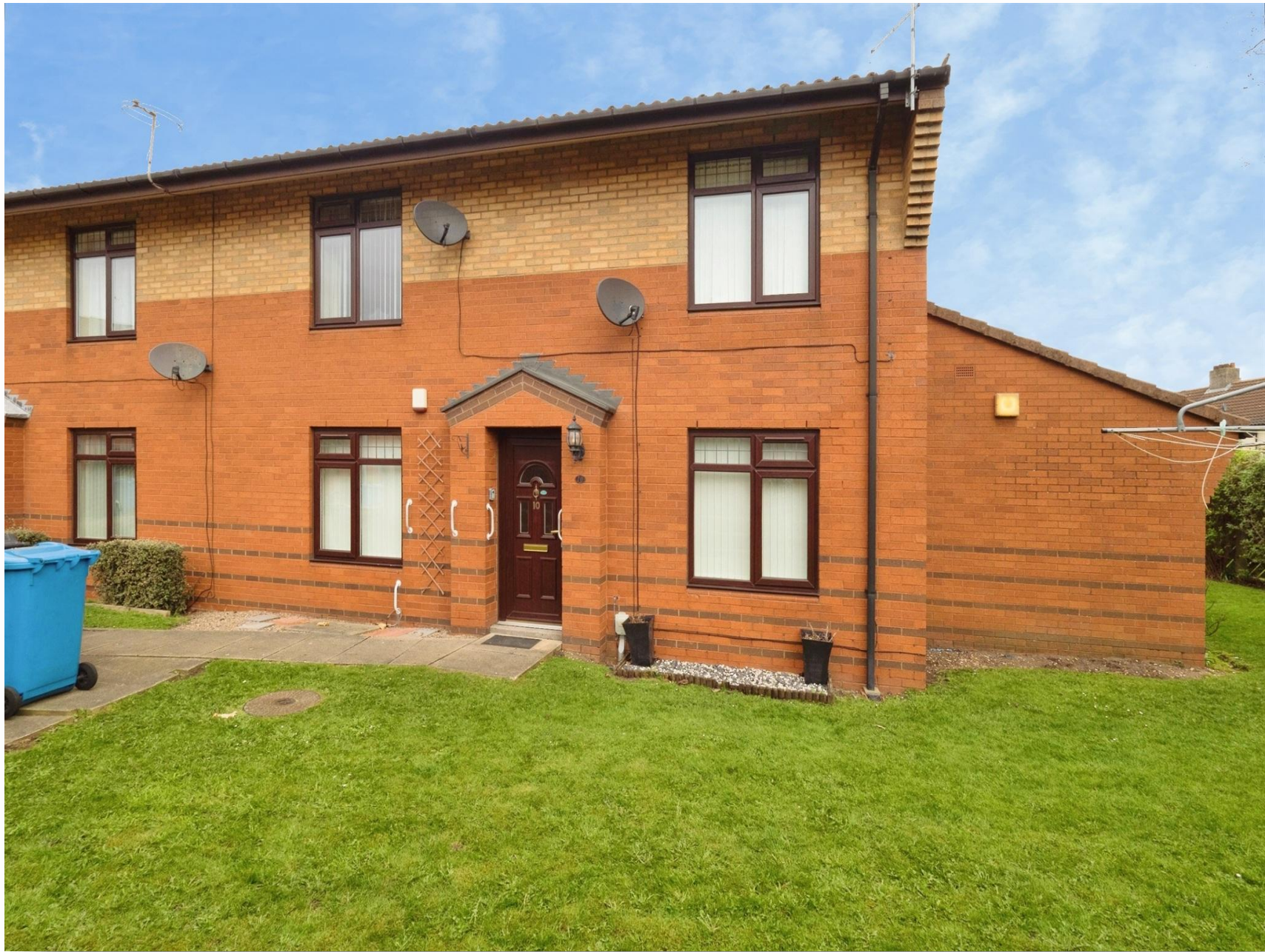
St. Georges Walk, Hull, HU9 4SF