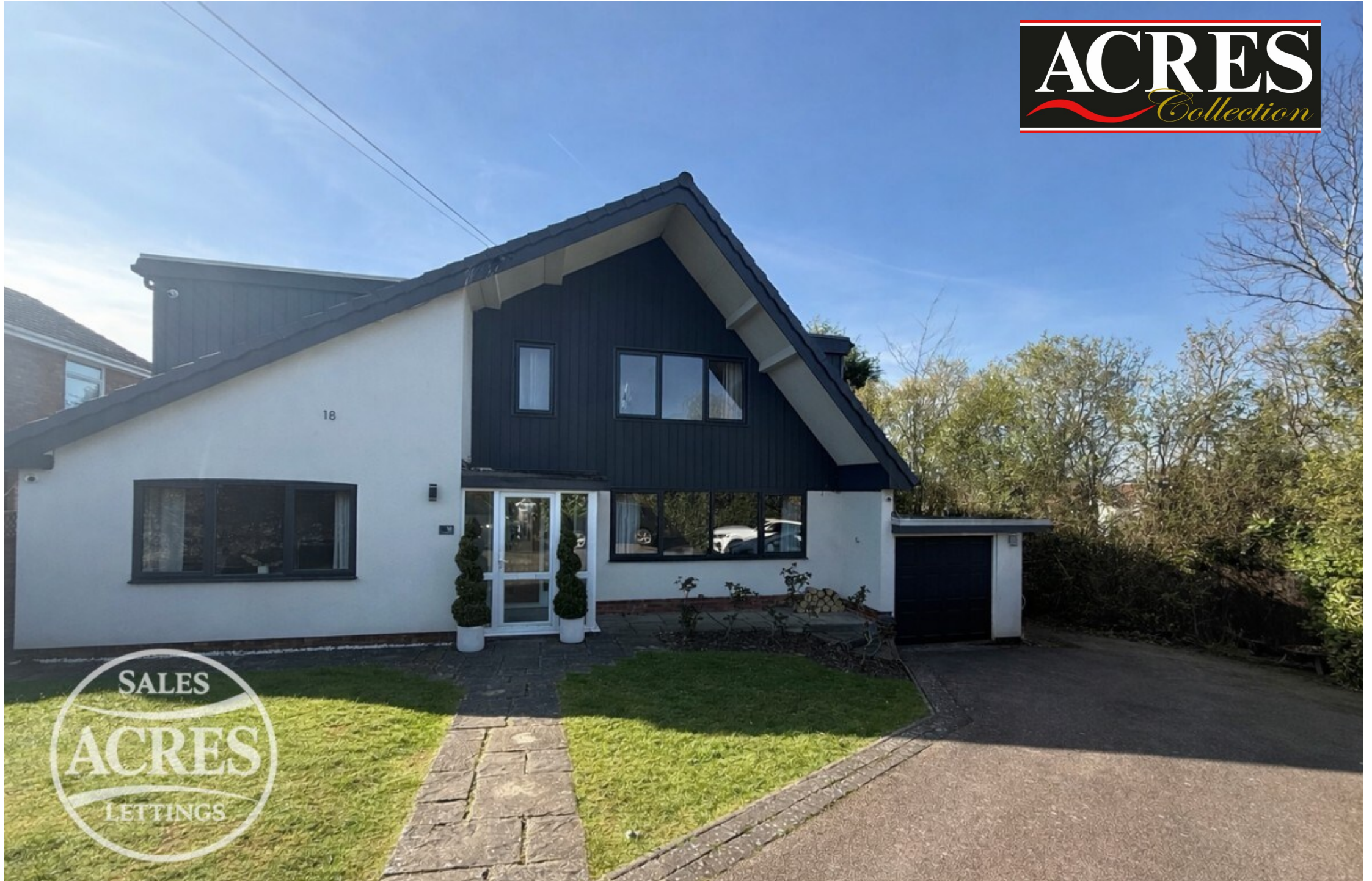
18 POPLAR RISE, LITTLE ASTON B74 4HT