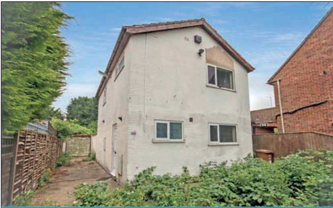
All enquiries Ref: Callum Glenn