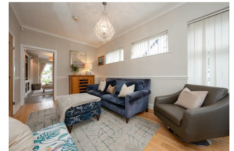
GOLF | CHARLOTTE HOUSE, GROUND FLOOR, 35-37 HOGHTON STREET, SOUTHPORT, MERSEYSIDE, PR9 0NS