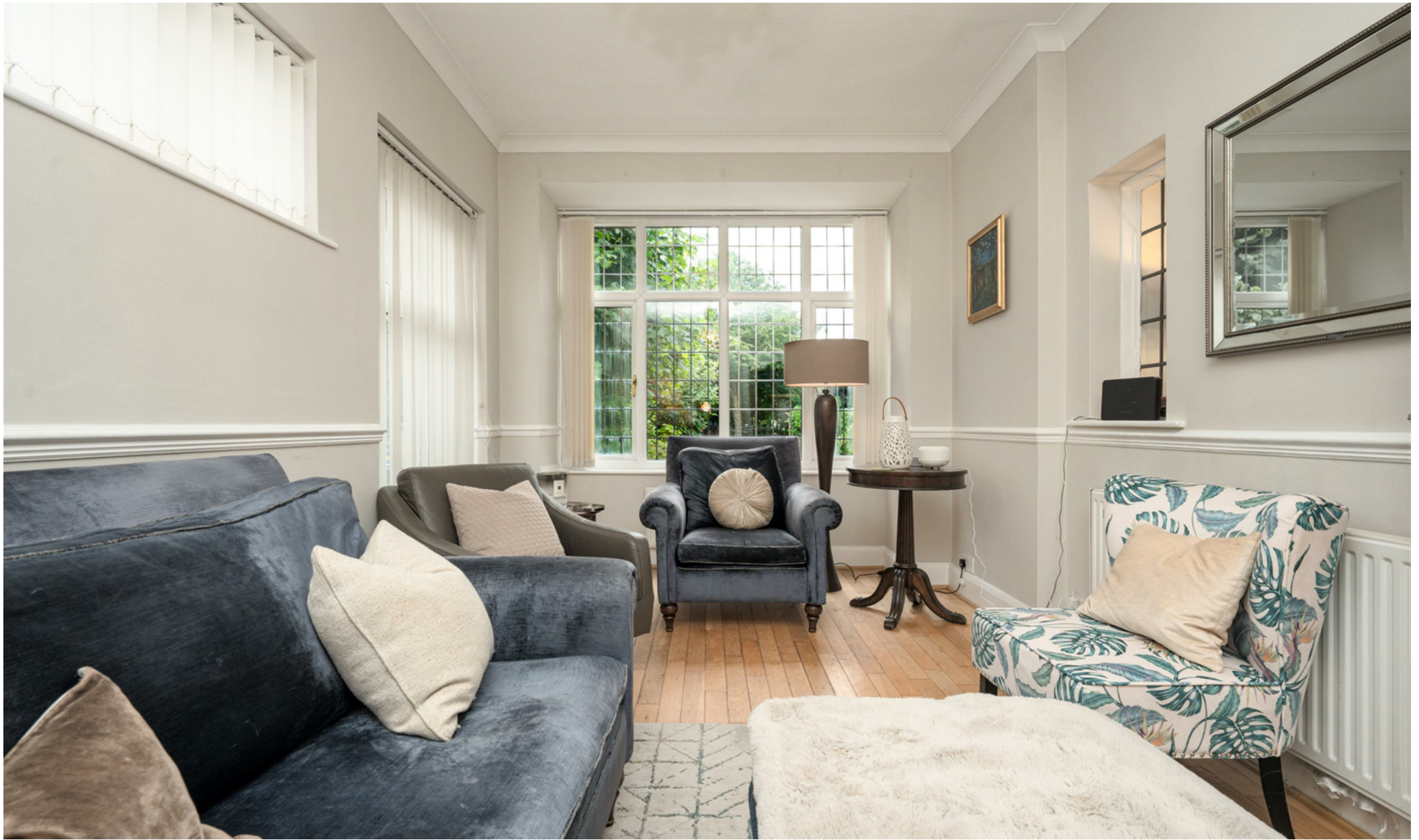
GOLF | CHARLOTTE HOUSE, GROUND FLOOR, 35-37 HOGHTON STREET, SOUTHPORT, MERSEYSIDE, PR9 0NS