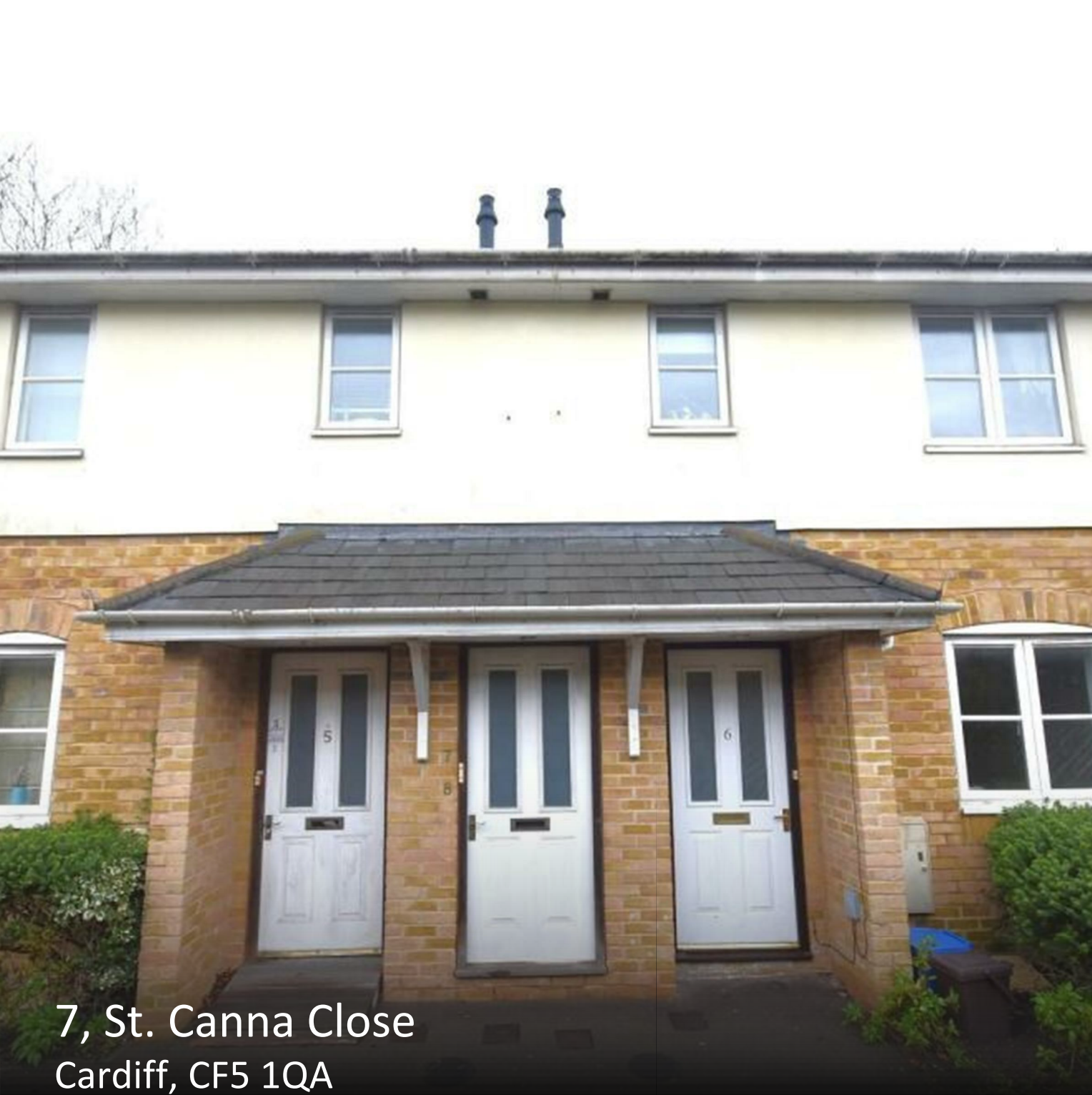
7, St. Canna Close Cardiff, CF5 1QA