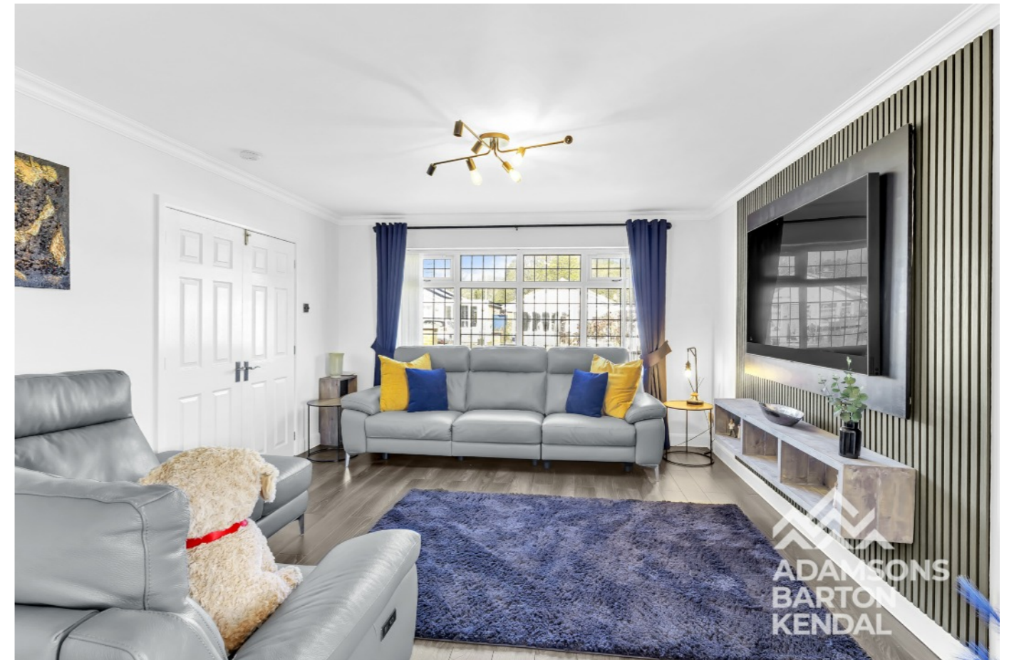
Edenfield Road, Rochdale OL11 5TA