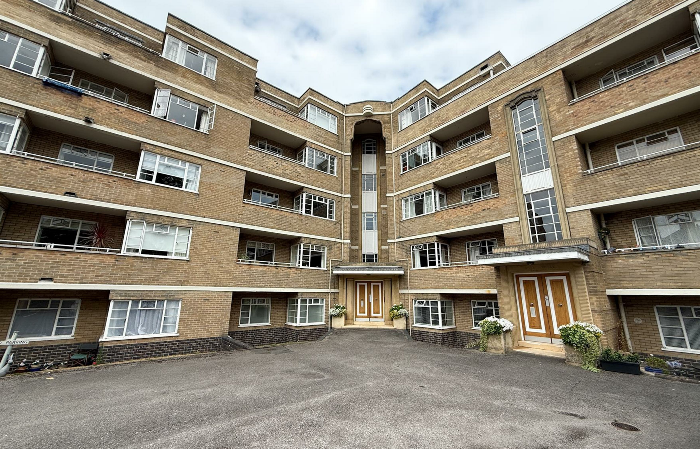
FLAT 1, SUFFOLK HOUSE WEST SUFFOLK SQUARE, CHELTENHAM, GL50 2HR