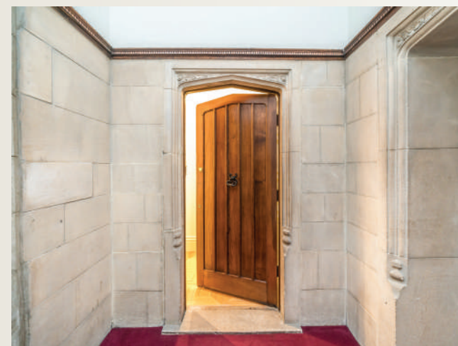
South Audley Street Views

South Audley Street is perfectly located for the various boutiques, restaurants, and hotels of central Mayfair. It runs between Grosvenor Square and Curzon Street and is opposite Grosvenor Chapel with world renowned Harry's Bar on your doorstep.