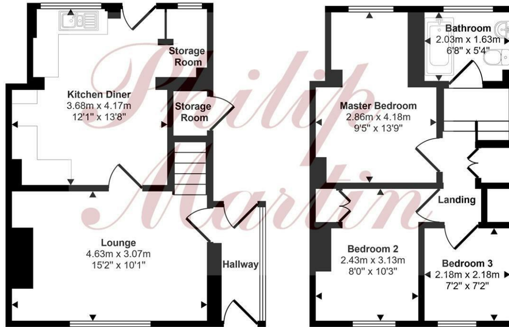
Ground Floor Approx 37 sq m / 397 sq ft