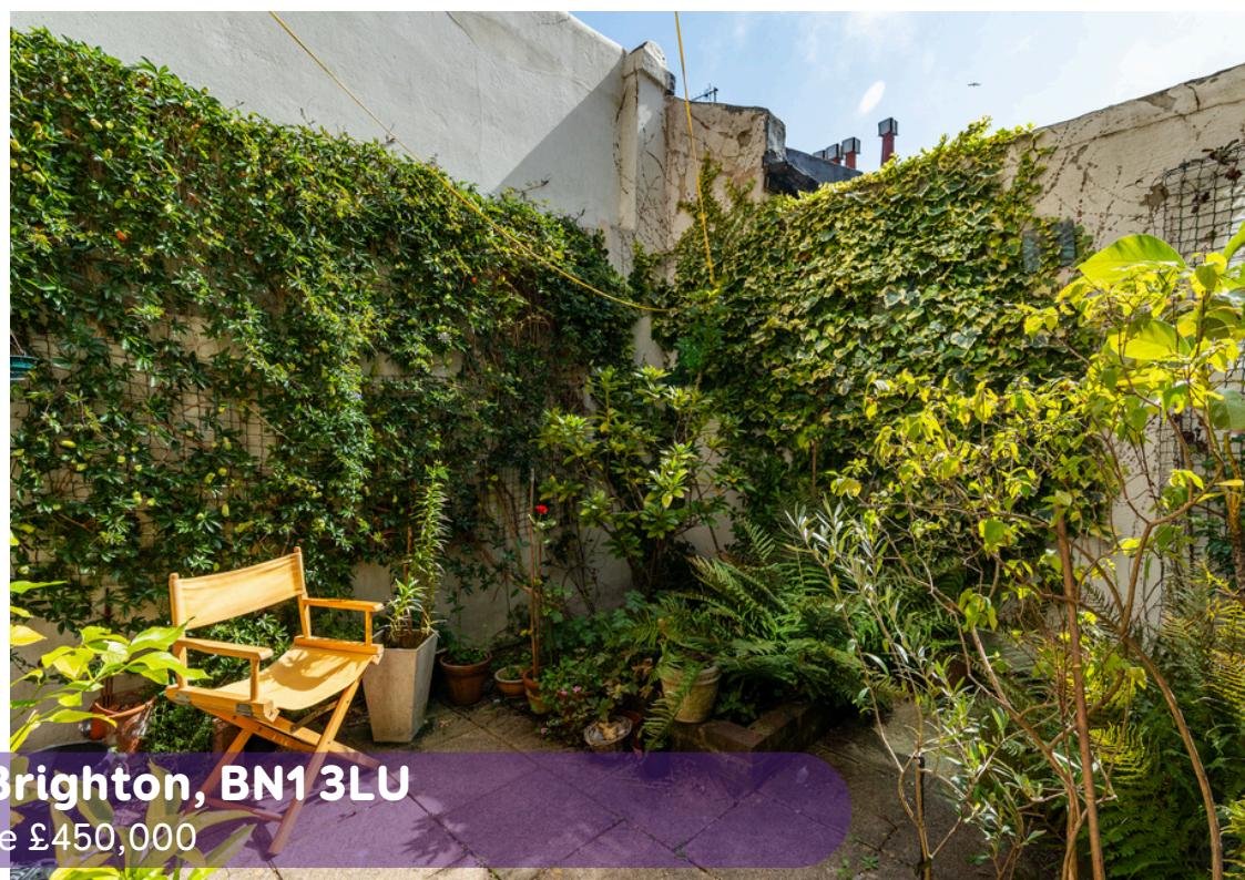
Guildford Road, Brighton, BN1 3LU Asking Price £450,000