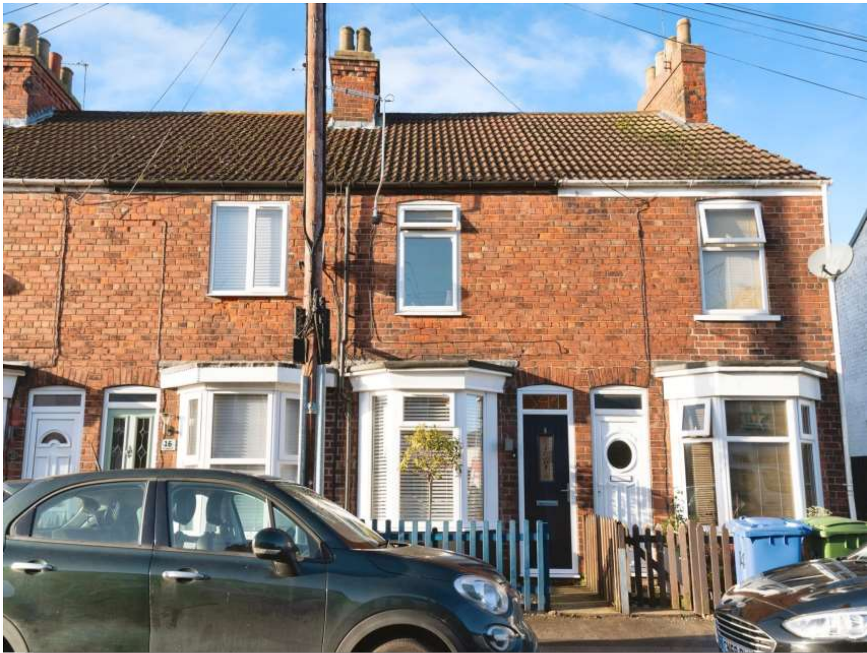
Beaver Road, Beverley, HU17 0QW