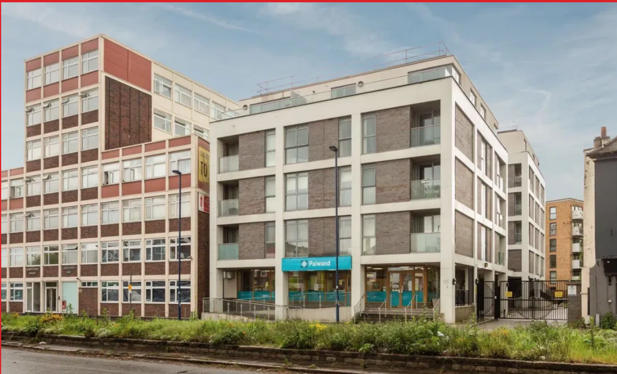
Futura Apartments, Edgware, HA8 Edgware