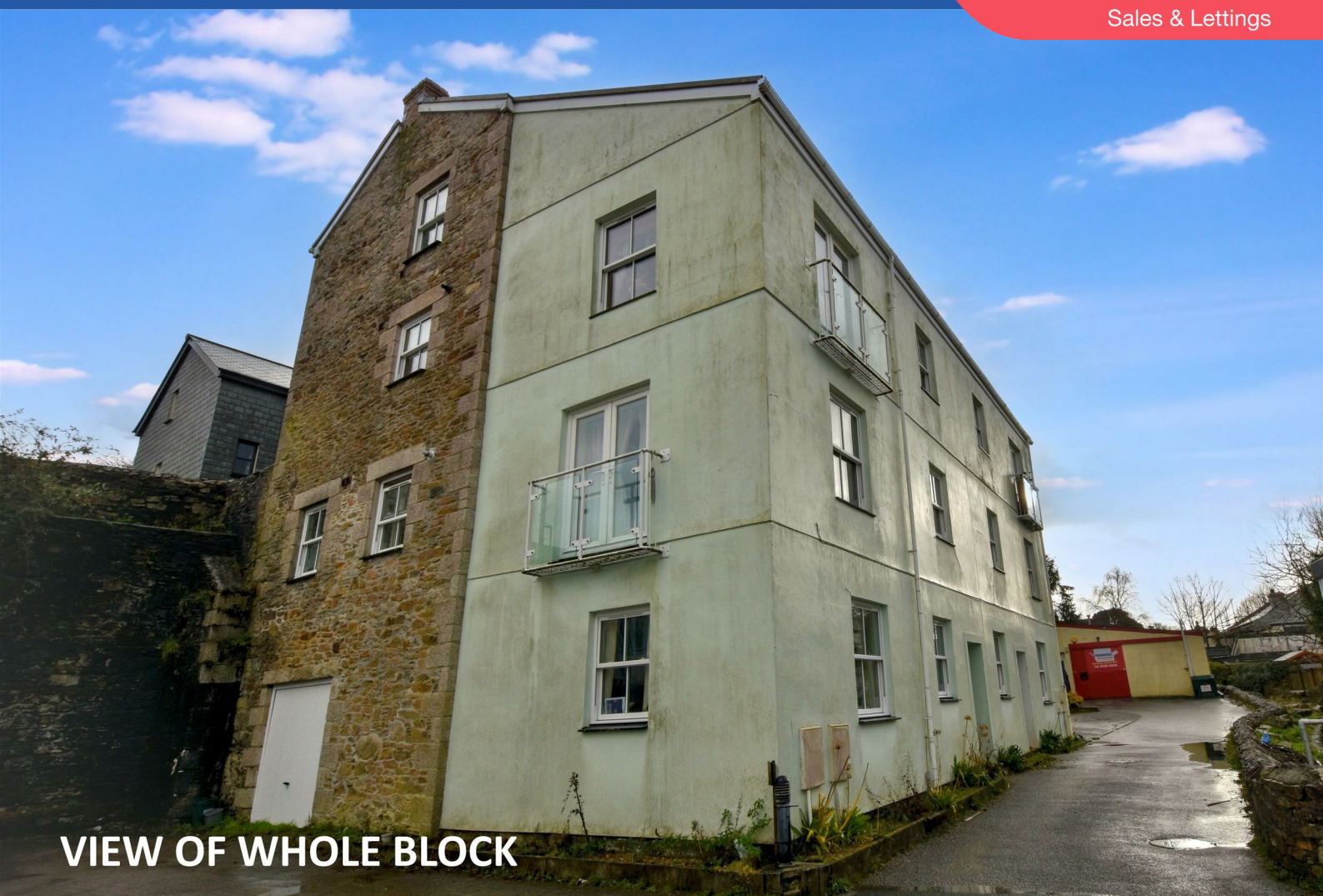
VIEW OF WHOLE BLOCK