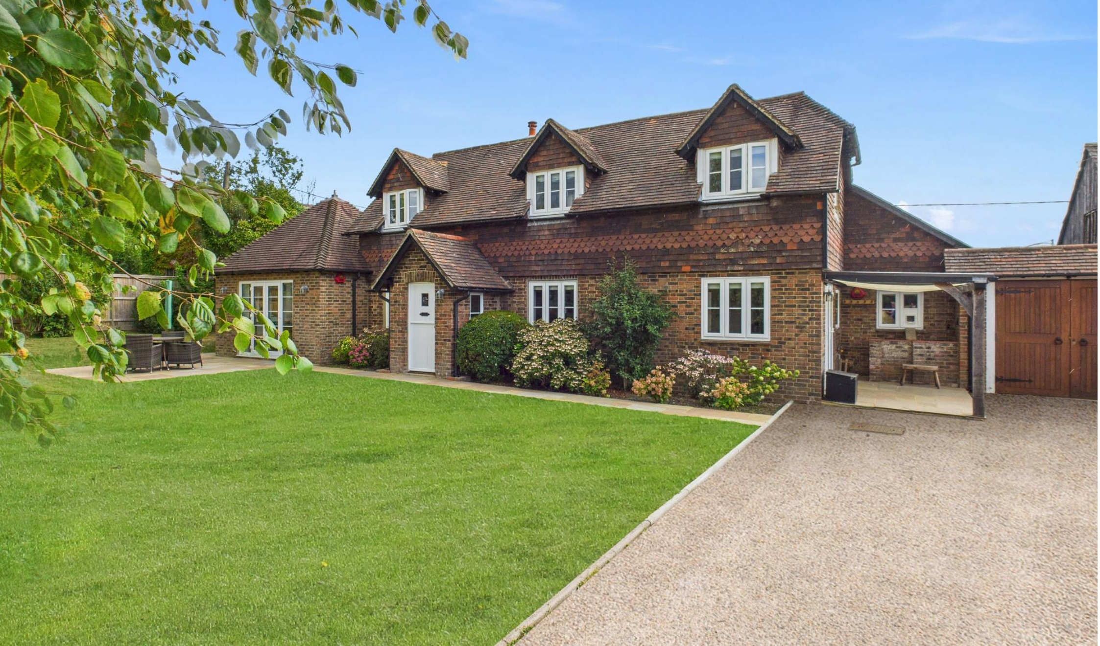
Apple Cottage, Old Mill Farm Cowfold Road, Bolney, RH17 5SE