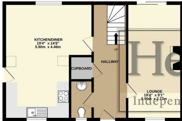
GROUND FLOOR 564 sq.ft. (52.4 sq.m.) approx.