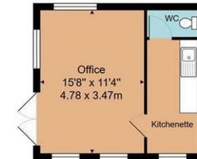
Office 15'8" x 11'4" 4.78 x 3.47m