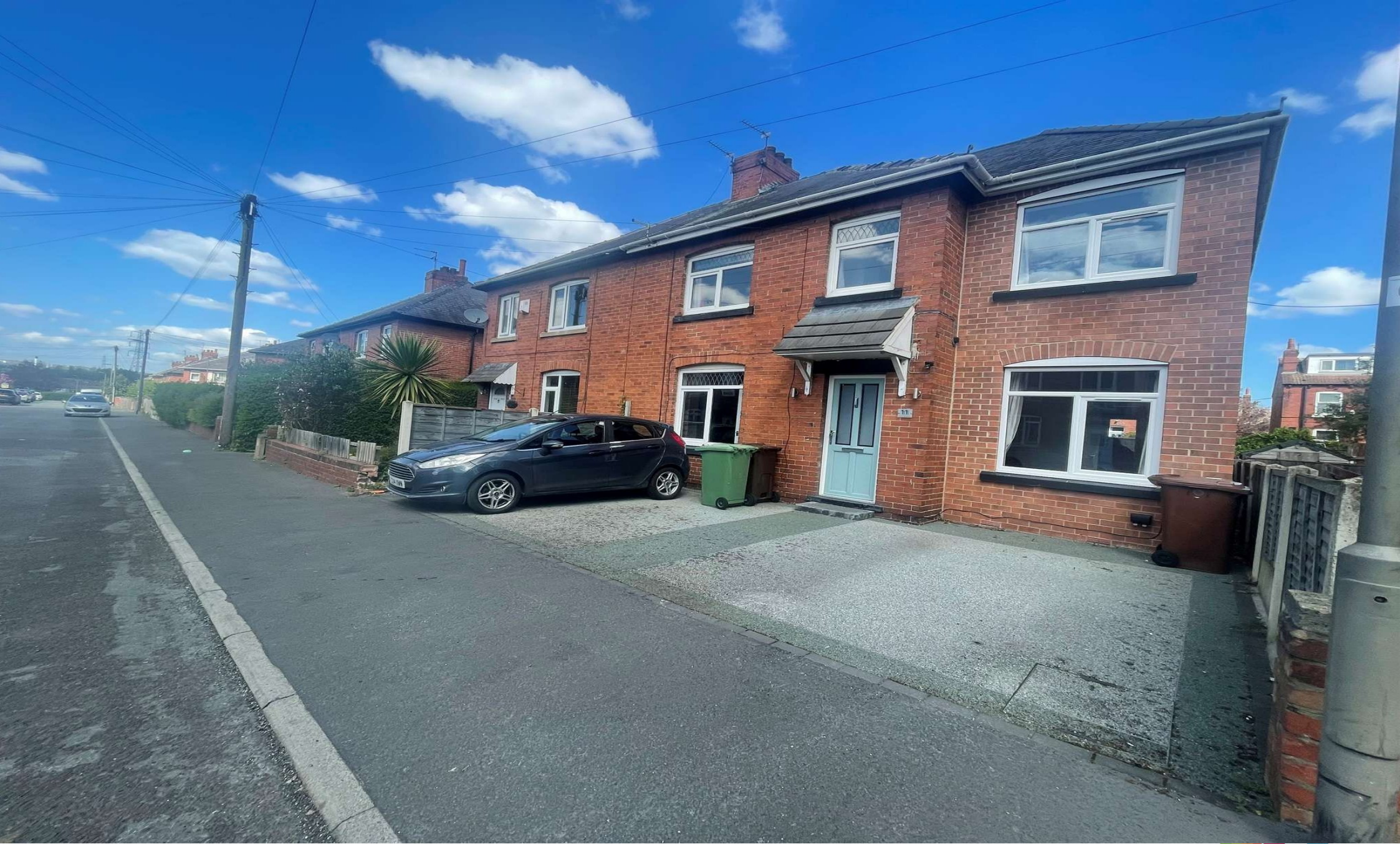
Church Lane Avenue, Wakefield WF1 2JU