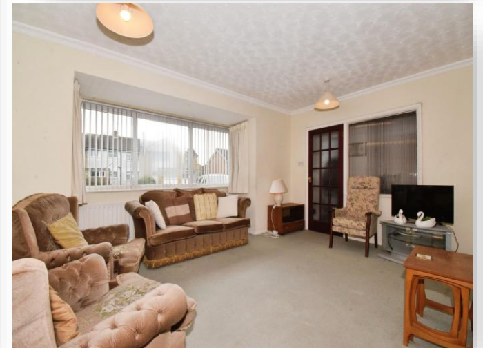
Ash Tree Road, Oadby Leicester LE2 5TD