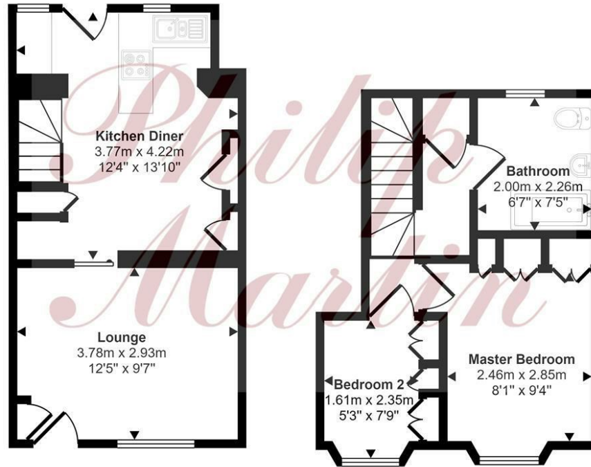
Ground Floor Approx 27 sq m / 291 sq ft

Approx Gross Internal Area 52 sq m / 556 sq ft