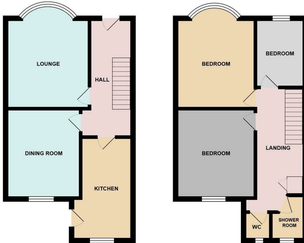
10 Priory Avenue Southend SS2 6LD