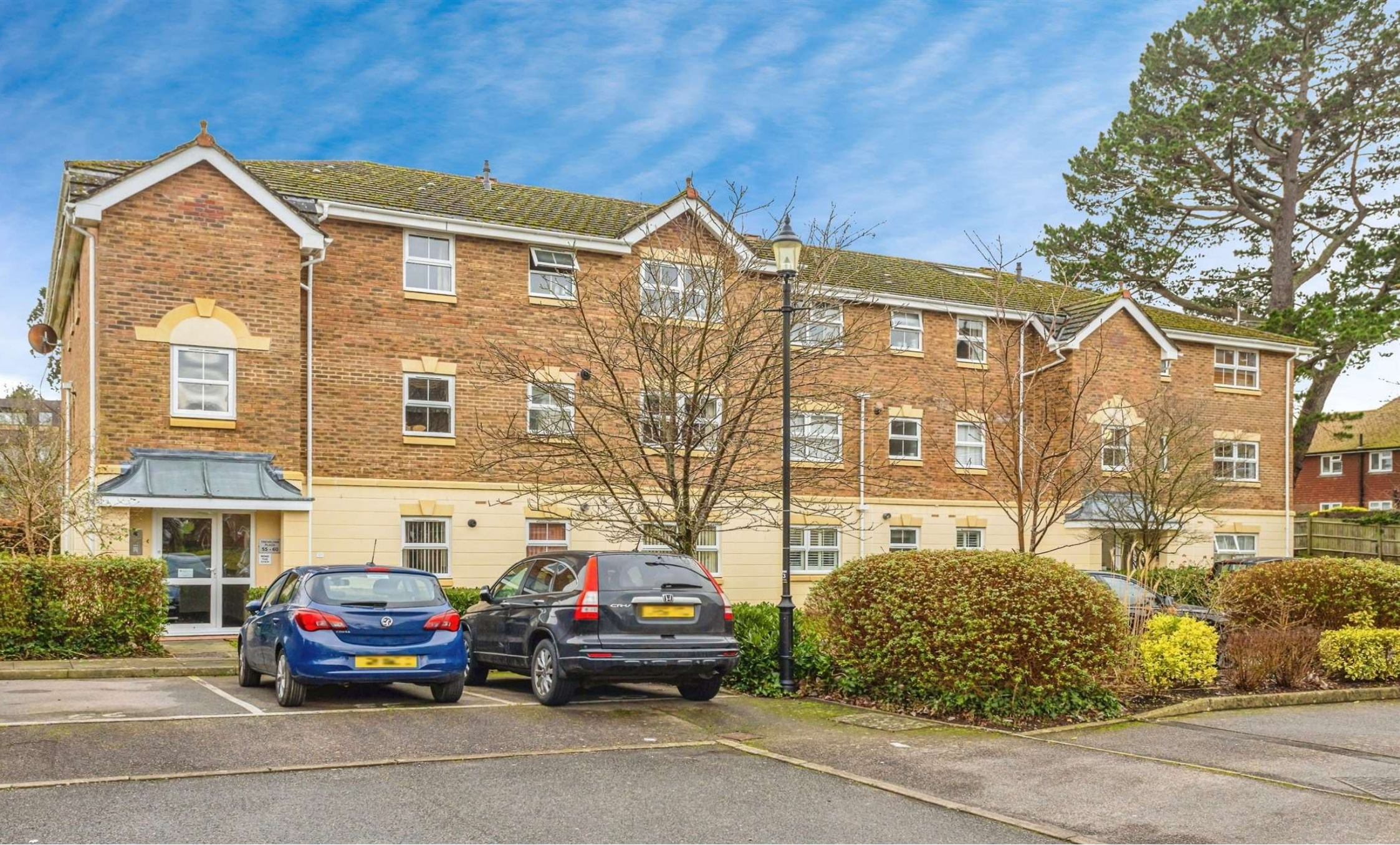
Trevelyan Place, Heath Road, Haywards Heath RH16 3AZ