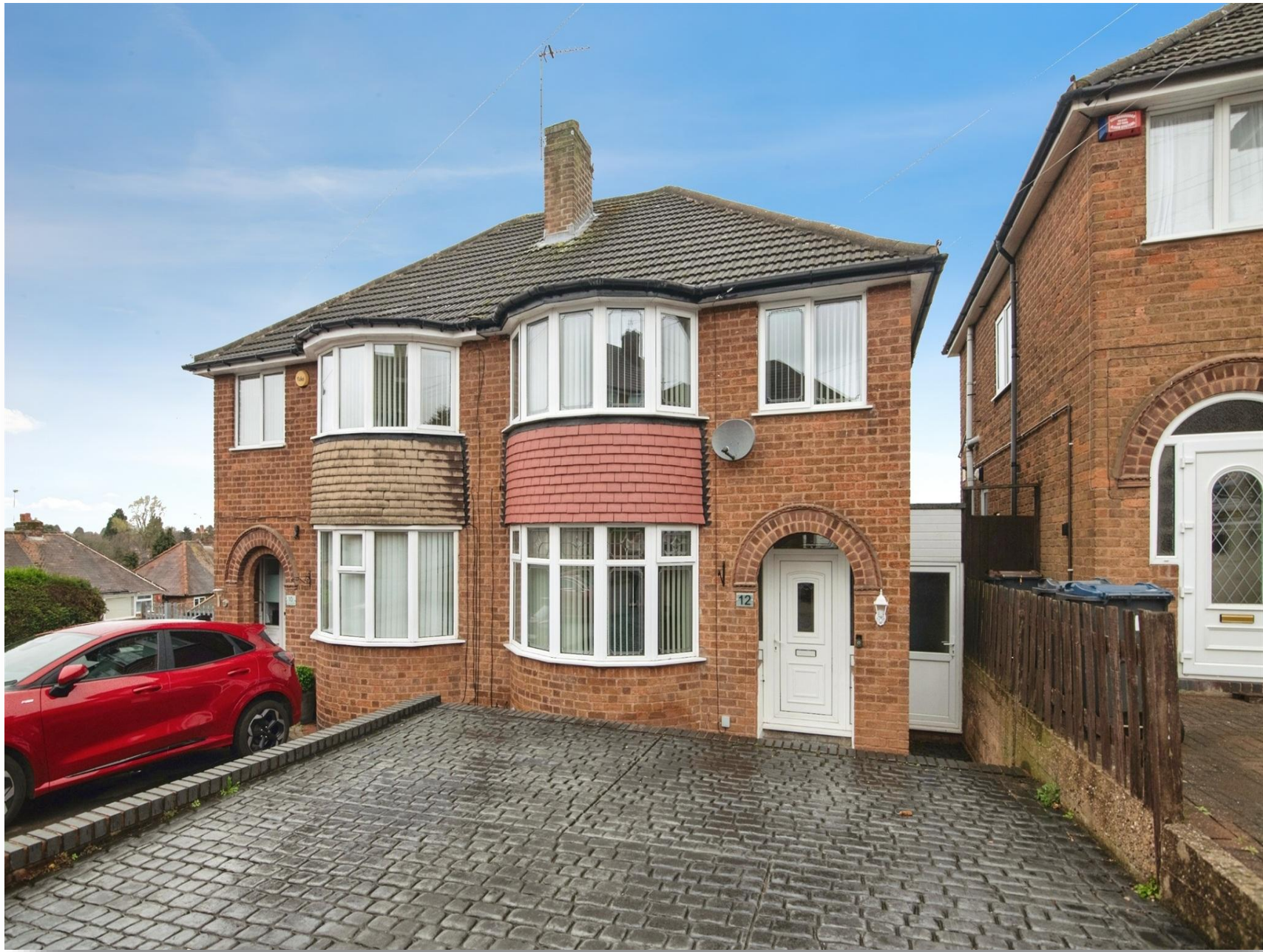
Sandwood Drive, Birmingham B44 8SD