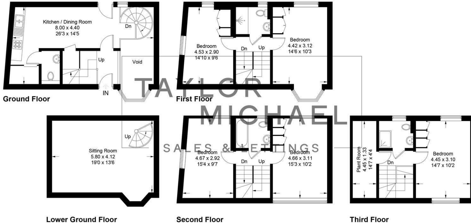
Illustration for identification purposes only, measurements are approximate, not to scale. Imageplansurveys @ 2026