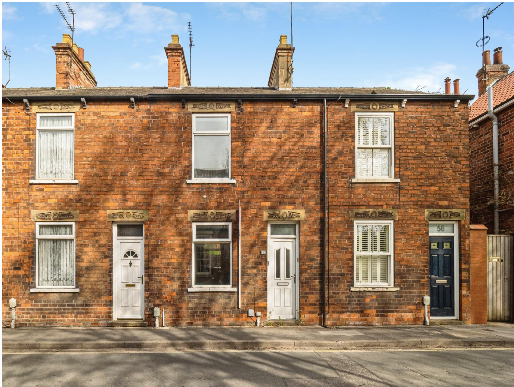
Keldgate, Beverley, HU17 8HY