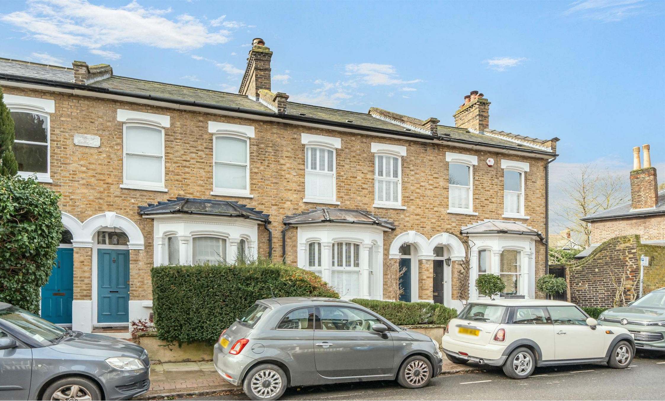
Gentlemen Row, Enfield, EN2 6PU