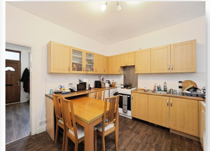
Queens Road, Loughborough