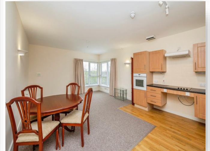
Green Lane View, St. Michaels Avenue, Aylsham, Norwich, NR11 6GA