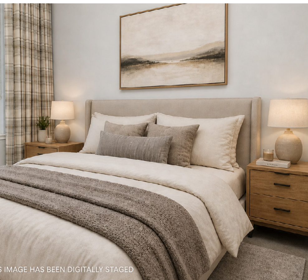
THIS IMAGE HAS BEEN DIGITALLY STAGED