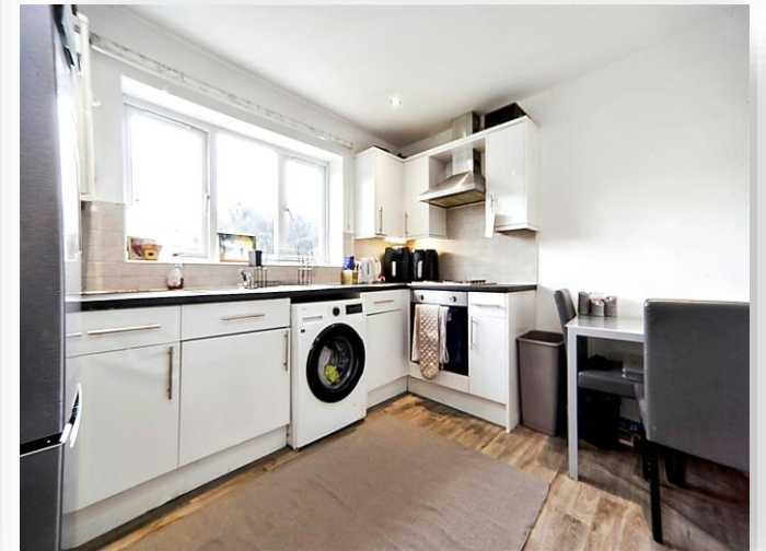
Iveson Villas Iveson Road, Leeds LS16 6NN