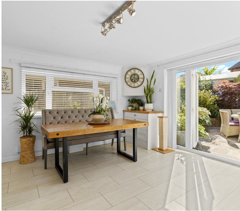
Hawks Road, Hailsham