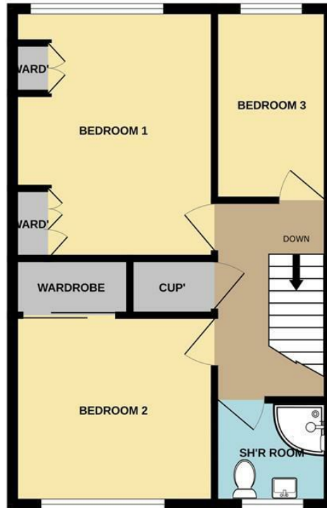
1ST FLOOR 453 sq.ft. (42.1 sq.m.) approx.