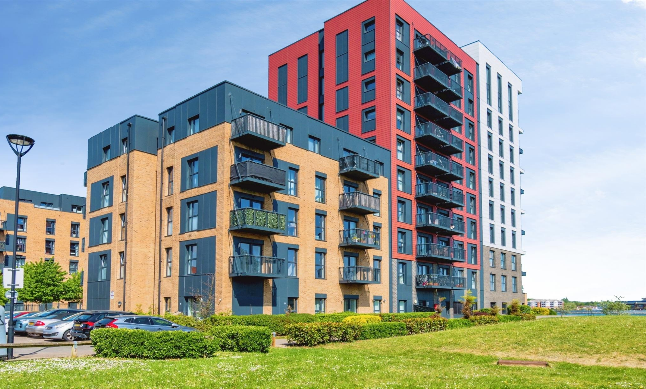
Television House, Meridian Way, Southampton SO14 0FS