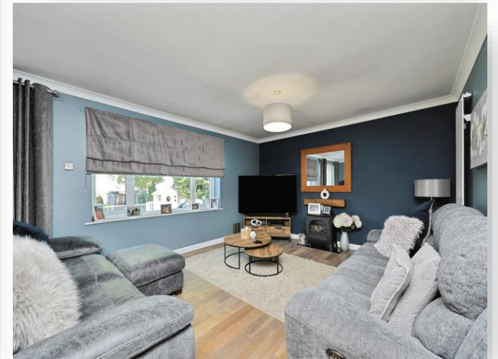
George Drive, Drayton, Norwich, NR8 6DU