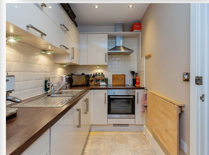
Stanton House Coxhill Way, Aylesbury HP21 8FW