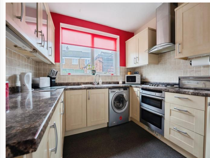
Philips Lane, Great Sutton Ellesmere Port CH66 4TP