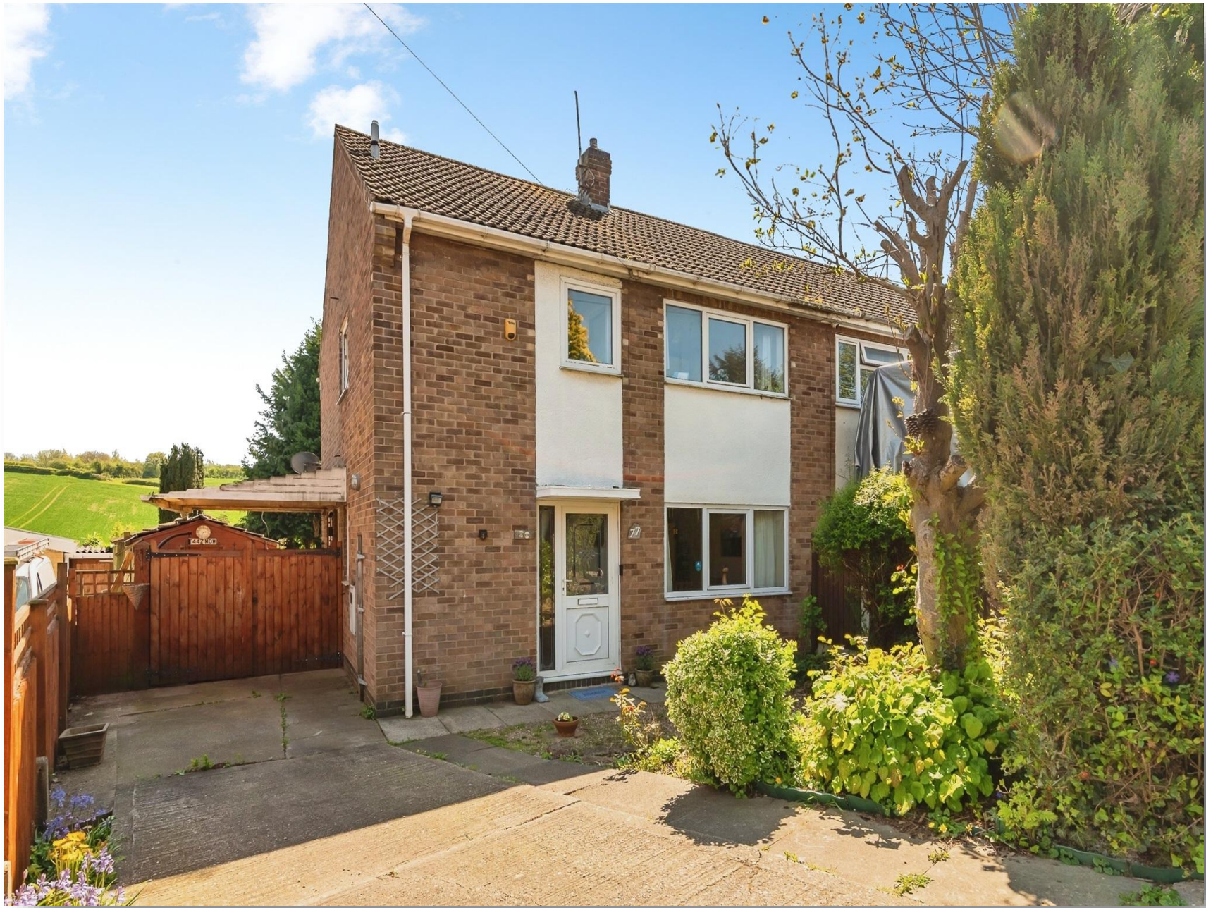
Cromwell Crescent, Lambley Nottingham NG4 4PJ