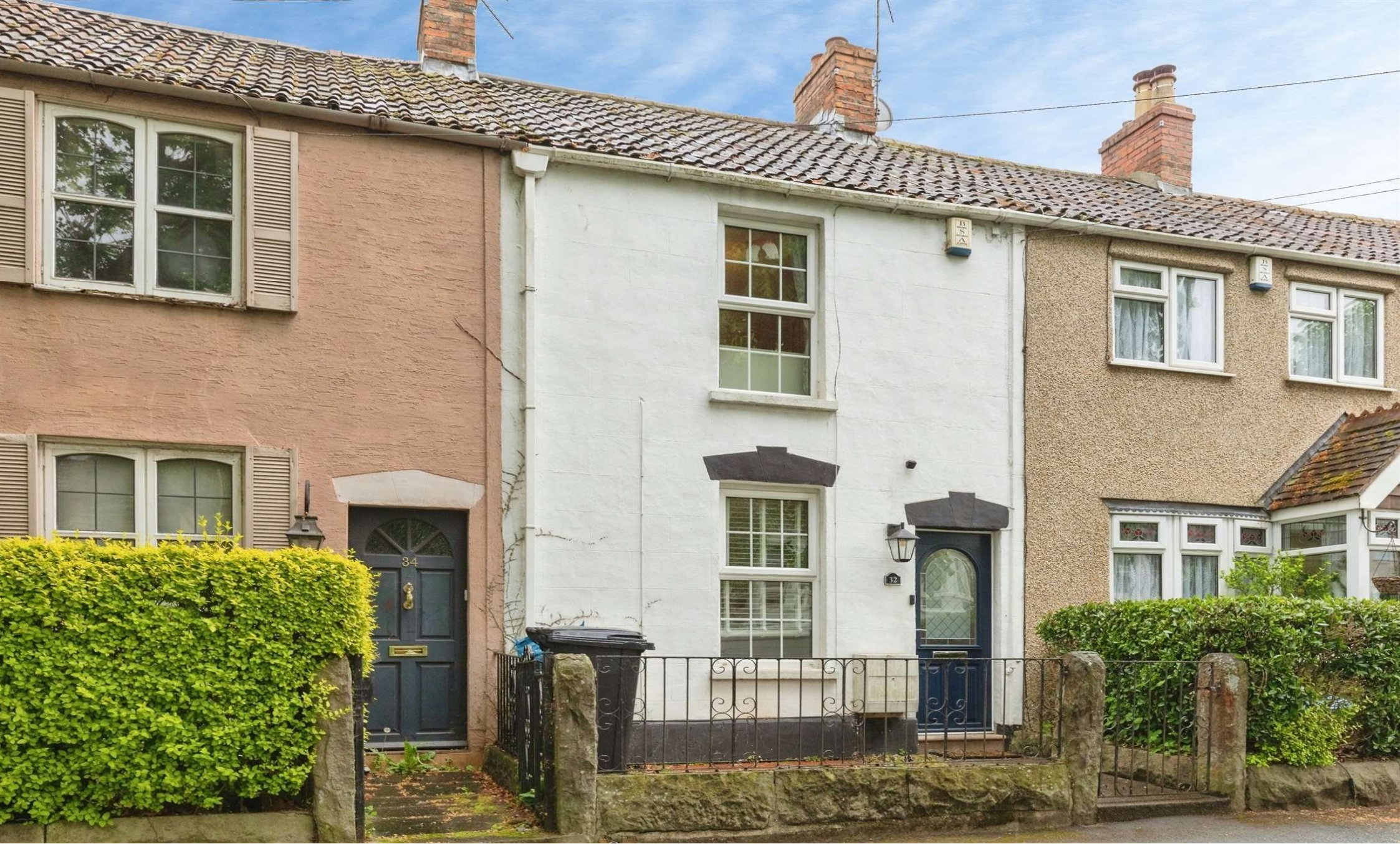
Downend Road, Fishponds Bristol BS16 5AW