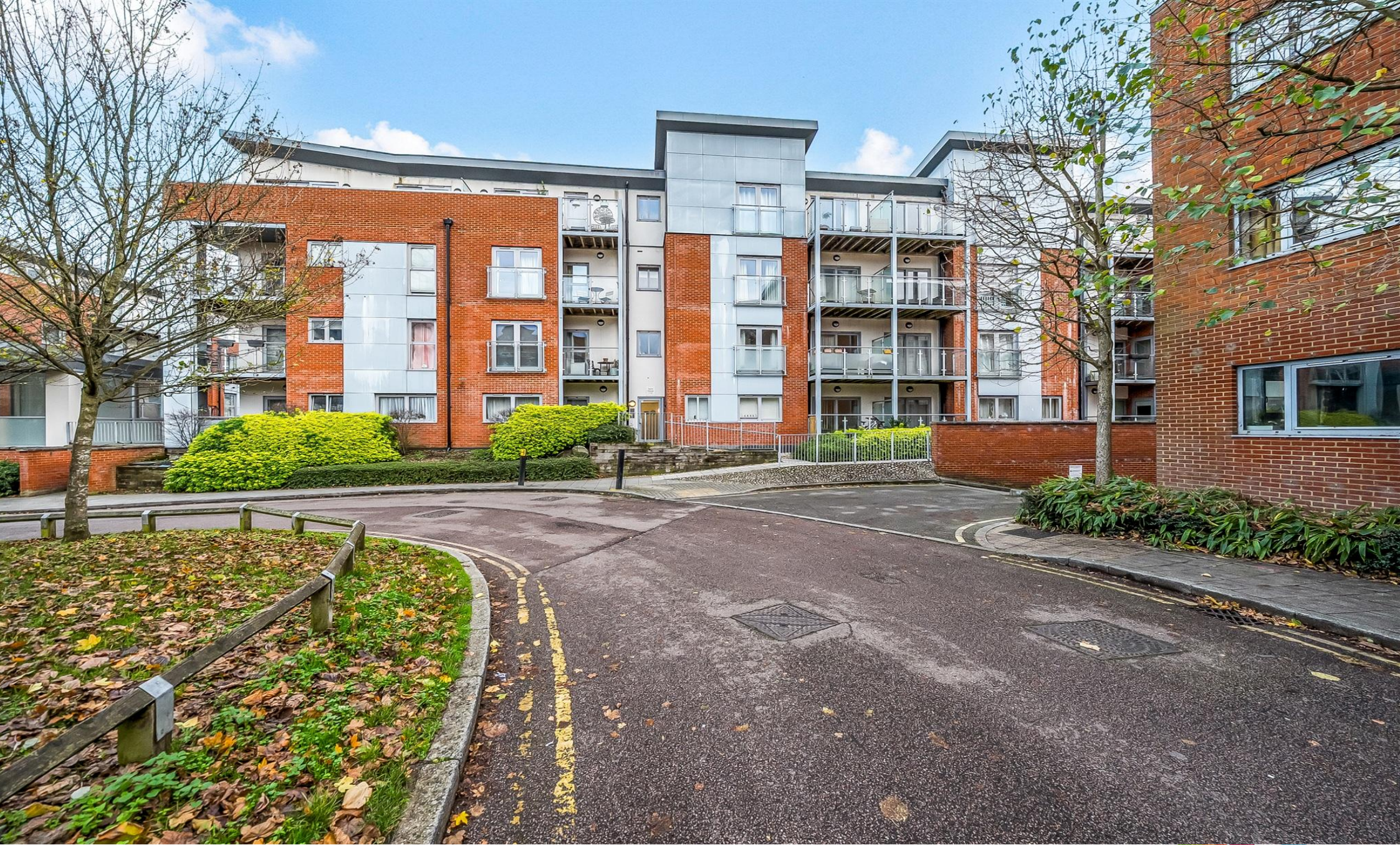
Serra House, Charrington Place, St. Albans, AL1 3FU