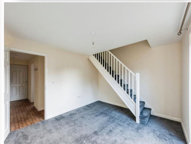
Heathlands, Beck Row IP28 8FA