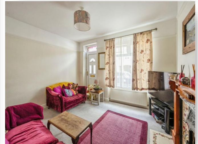
Helena Street, Mexborough S64 9PF