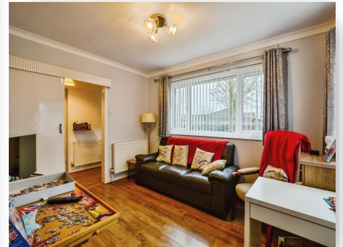
Richmond Drive, Skegness PE25 3PQ