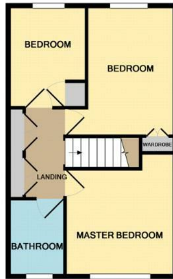
1ST FLOOR APPROX. FLOOR AREA 37.6 SQ.M. (405 SQ.FT.)