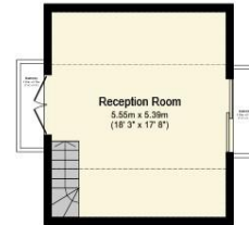
Annex First Floor