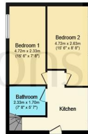
Annex Ground Floor