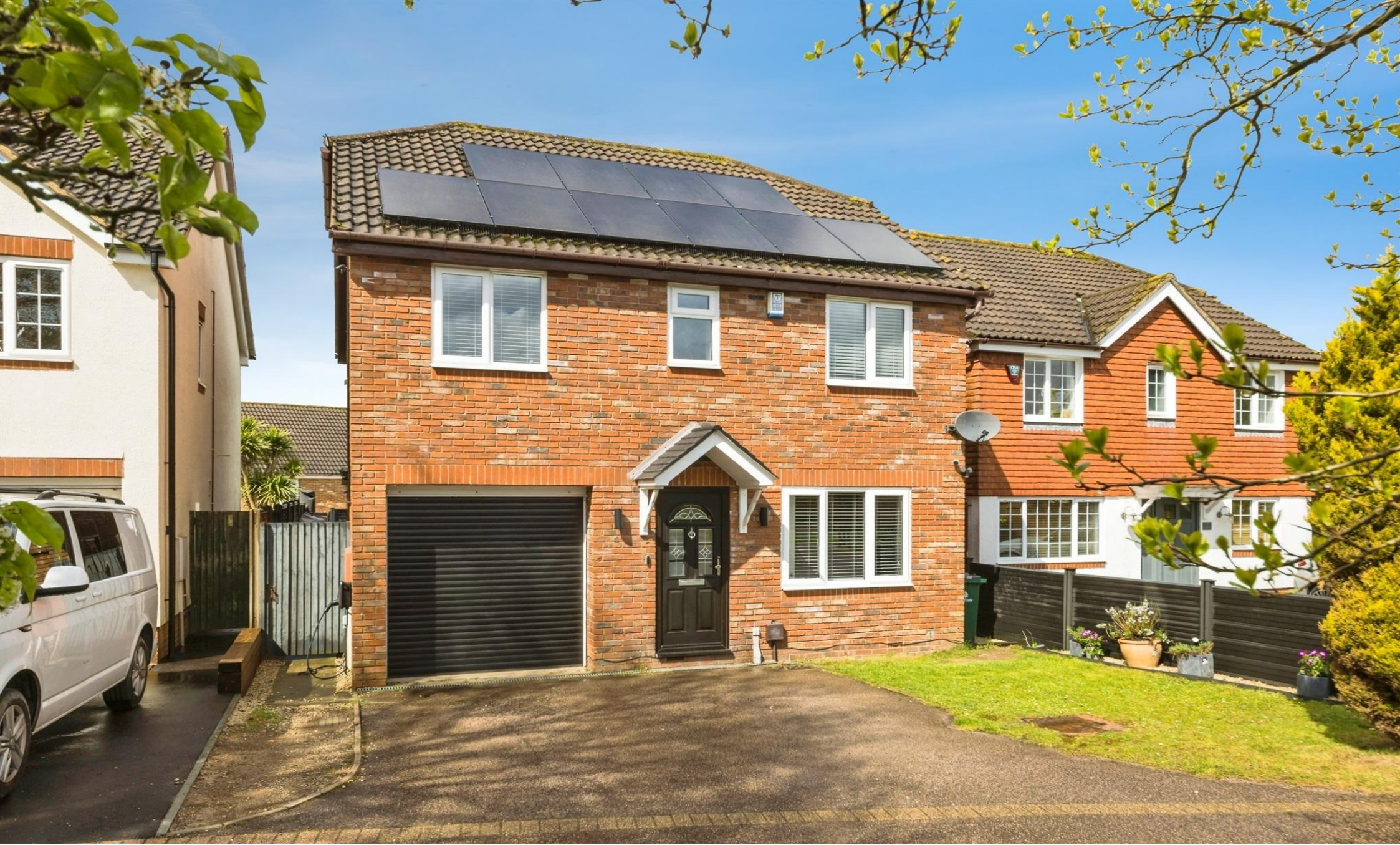
Harper Drive, Maidenbower Crawley RH10 7LD