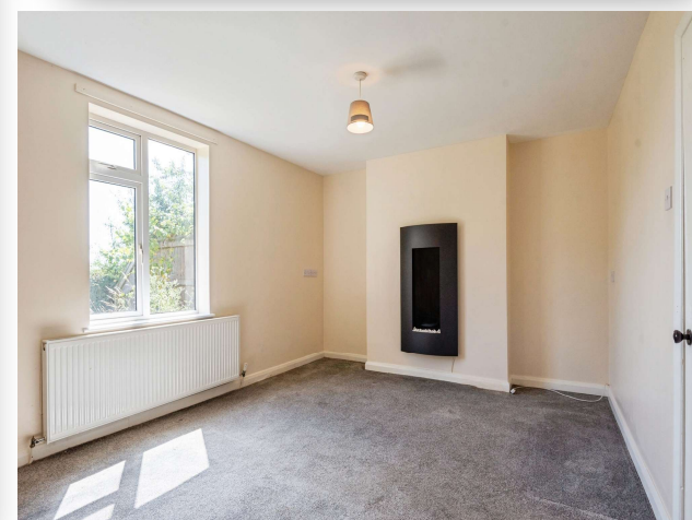
North Beck Cottages North Beck, Screddington NG34 0AD