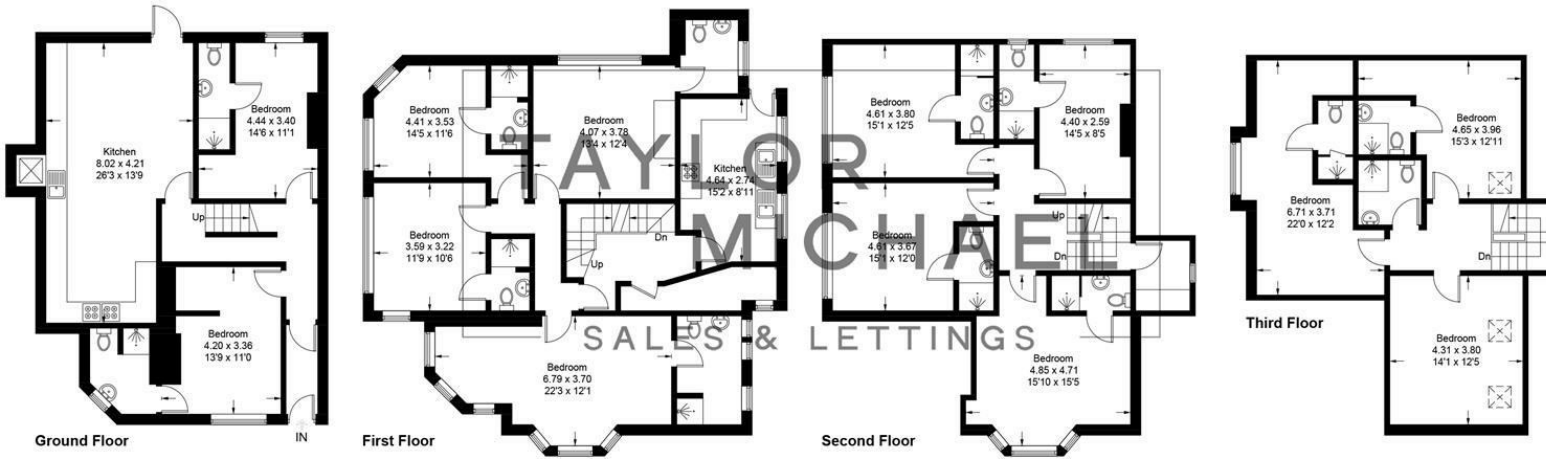
Illustration for identification purposes only, measurements are approximate, not to scale. Imageplansurveys @ 2026