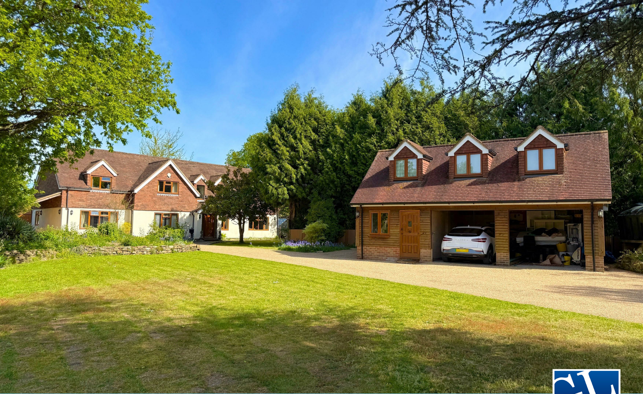
Frith Cottage, Stall House Lane, Pulborough, West Sussex RH20 2HR