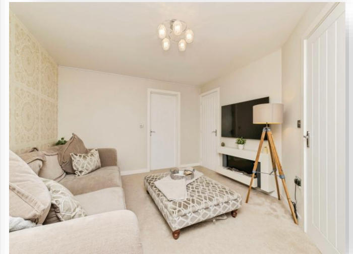
Stoney Wood Drive, Wynyard Billingham TS22 5UE