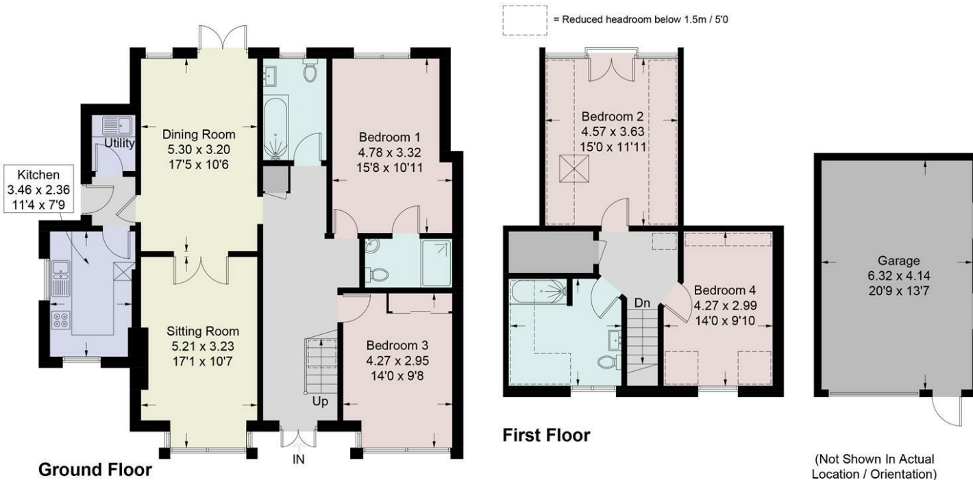
Illustration for identification purposes only, measurements are approximate, not to scale. Pursuant to RICS property measurement 2nd edition © Intelligent Property Marketing 2026